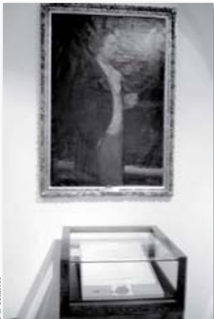
Painting of Ignacy Paderewski and his honorary doctorate conferred on 3 June 1919h

those who fell in battle and a memorial tablet containing the names of the students killed in battle in 1914-1918. And another symbolic monument to the restoration of independence was the oak tree, with a plaque reading 'The Liberty Tree was planted here on 3rd May 1919 to commemorate the restoration of independence of the Republic of Poland in 1918', which was planted in front of the building of Collegium Novum. Twenty years later the Liberty Oak irritated the Nazis and it was cut down. After World War II was over it was planted anew and since then has been a symbol of the fight for independence and social justice. Next to the first memorial tablet put in 1919 another one was placed on 6 November 2004 to commemorate the victims of World War II, 'Here the soil brought by the Kraków academic expeditions in the years 1999-2004 from the places of martyrdom of the professors and students of the higher education institutions of the Second Polish Republic: Sachsenhausen, Dachau, Katyń, Charków, Lwów, Palmiry, Ponary, Kuropaty, Majdanek, Auschwitz, Poznań, Ravensbrück, Mauthausen, Stanisławów, Warszawa, Nowy Wiśnicz, Kraków.'