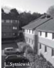
Hall of residence