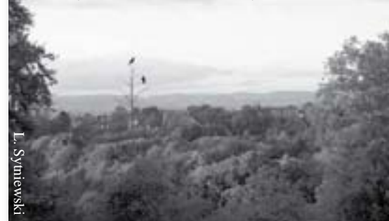
View from the students' hall of residence