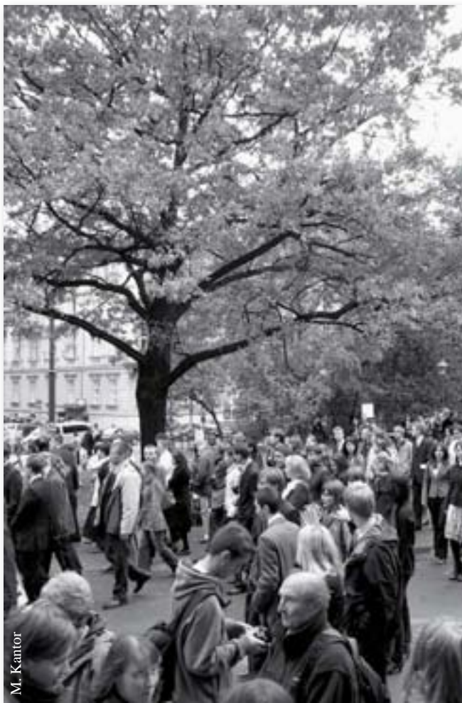
Liberty Oak in front of Collegium Novum on 1 October 2008

It is worth adding that the Jagiellonian University chronicled the days that saw Poland regaining independence in several acts fostering national remembrance. It conferred honorary doctor's degrees on such distinguished public figures as prime Minister Ignacy Paderewski, the Head of State Józef Piłsudski, U.S. President Thomas Woodrow Wilson, the French Prime Minister Georges Clemenceau and General Ferdinand Foch, Marshal of France, Herbert Hoover in the USA and Cardinal Desidero Mercier of Belgium (for their charity campaigns for Poland). It made a register of