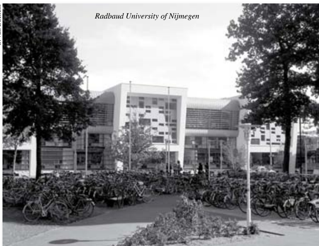
Radbaud University of Nijmegen