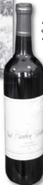
The vineyard in Łazy