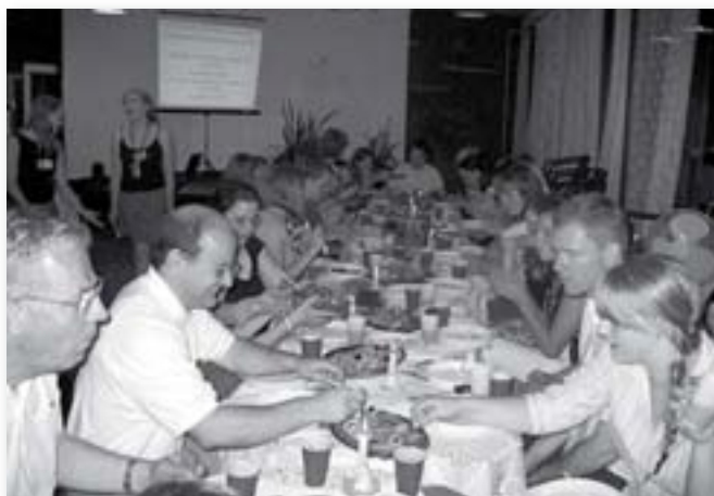
Celebrating the Polish traditions