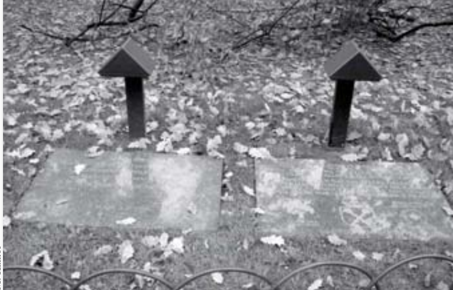
Memorial tablets under the Liberty Oak

Another group of students was moved to Prague. After the front had moved away from Kraków the evacuees returned to the city. But the war prevented many academic teachers and students from returning to Kraków to resume their studies.