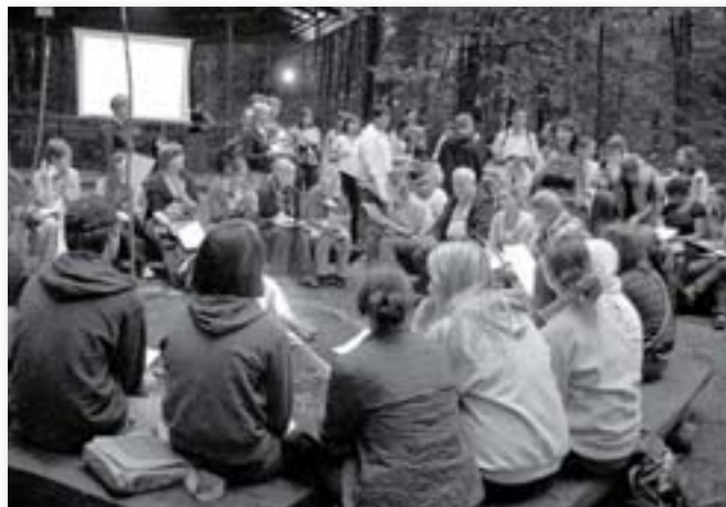
Learning Polish songs