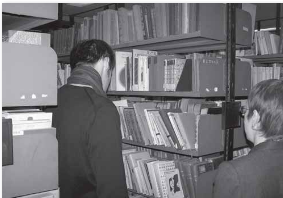
The Institute Library

Didactic activities were resumed only in the year 1966. The new