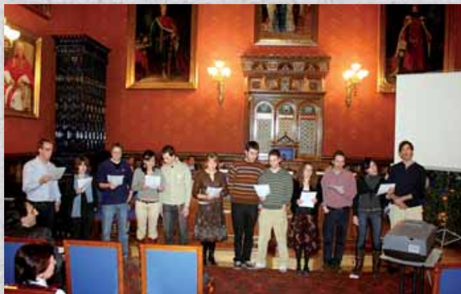
Singing for Fun in Kraków, students from the Centre for European Studies

a happy and lively 'Happy Moon' dance and a song in Chinese entitled 'Sweet Honey', before an international group 'Singing for Fun in Krakow', composed of students from the Centre for European Studies, came up to sing a popular song 'Always Look on the Bright Side of Life', encouraging everyone to whistle and sing along to the refrain. Their second song was a funny philosopher's song.