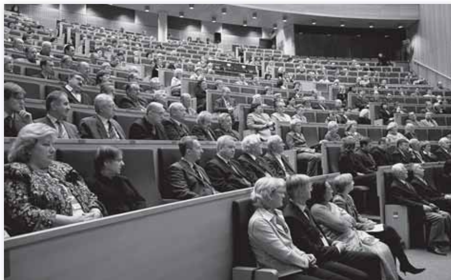
Auditorium Maximum – the venue of the Congress