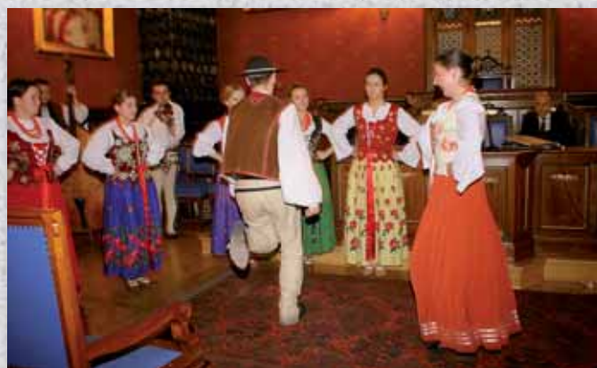
Student Highlanders Folk Music and Dance Group 'Skalni'

In turn the Student Highlanders Folk Music and Dance Group 'Skalni' performed two traditional highlanders dances.